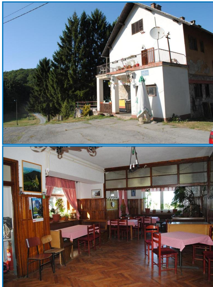
Slika 2. Planinski dom Petrov vrh

Regional meeting will take place in Planinarski dom Petrov vrh , which is actually hiking house on the idyllic hill in the middle of the wood. You can see its exact location on the following link: Google maps http://tinyurl.com/3d4duvp .