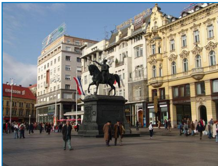
Slika 1. Ban Josip Jelačić Square

Zagreb has a rich civil and cultural heritage, dating from the pre-historic period and archaeological finds of the Roman culture up to the present. The historical part of the town, the Upper Town and Kaptol are a unique urban core even in European terms, and thus represent the target of sightseeing tours. The old town, its streets and squares can be reached on foot, starting from Ban Josip Jelačić Square , the central part and the heart of Zagreb, or by a funicular in the nearby Tomićeva Street. The old core of the town includes many famous buildings, churches, museums and institutions as well as pleasant restaurants and coffee bars.