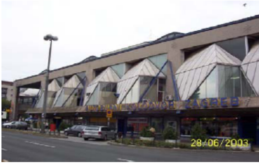
Zagreb Bus Station

map of the city at one of the kiosks. Or you can trust our navigation skills and follow the instructions in this guide. :-) If you decided to do so, keep on reading. :-) Buy the ticket (ticket costs 7 Kuna) for the tram at one of the kiosks in and around the station. Exit the building.