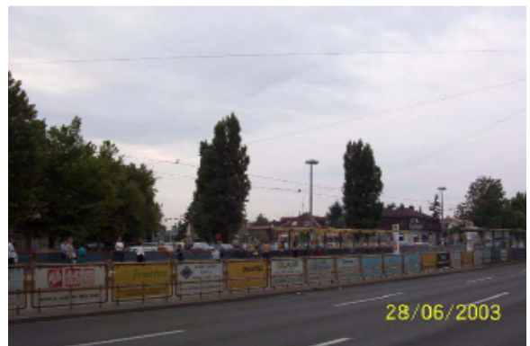
Tram station in front of Zagreb Bus Station

Wait for the tram number 5 (labeled Jarun on it's front side). If you are confused you can check a small map with all the lines at the stop. Or print the one we attached to this file. Once the tram gets there, get on the tram and get off at the 6th stop (not counting the one in front of the main bus station where you got on the tram). The name of the stop is Vrbik.