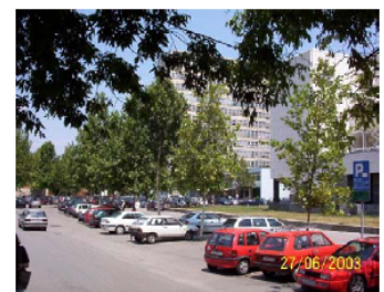
The parking lot

Now you can proceed to the entrance of the faculty. Once you have entered to the entrance hall, turn left. When you reach the end of the passage you will see elevators on your left and stairs on your right. Take the stairs and go one floor down. Turn left and proceed to a long corridor. Stop when you see a door on the right with a sign on it: "BEST Zagreb". Bravo!!! You found the hidden treasure. When you look inside, you'll know why. ☺