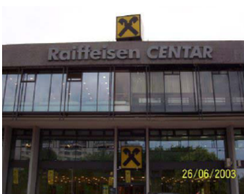
"Raiffeisen bank" sign

If you've forgotten to count ☺, you can easily recognize a yellow "Raiffeisen bank" sign on the right side of the tram stop. After you get off the tram, your next destination is FER: Faculty of Engineering and Computing at Unska 3. Why? Because that's where our BEST office is. ☺ Look straight ahead at the bank sign, cross the street and go to the right. After a very short walk you will notice a big parking lot on your left (not the one in front of the bank. ☺