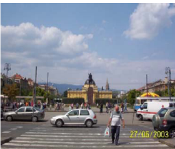
View from the Zagreb Railway Station

Get outside the building and you will find yourself on the King Tomislav Square. This is a very famous meeting place in Zagreb. Right in front of you there are two tram stops on each side of street. Go to the closer one where trams pass in the right direction. Wait for the tram number 2 or 6. One of these trams will take you to the previously mentioned main bus station (Autobusni kolodvor) after 3 stops – not counting the one where you got on the tram. This is the easiest way to find us, and you can't miss it. Get off the tram and follow the instructions from the main bus station (in Survival Guide labeled as - this part is also for BESTies who came by train- ).