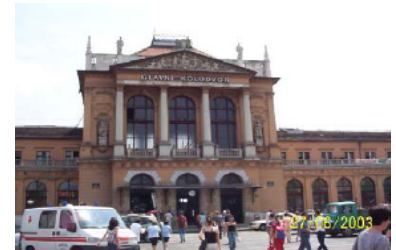
Zagreb Railway Station

Once you arrive at the main train station (Glavni kolodvor), buy the ticket for the tram at one of the kiosks at the station.